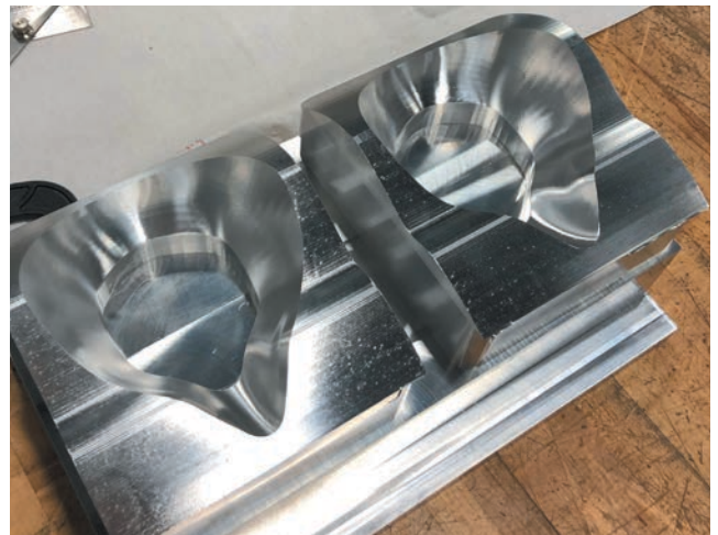
Cavities and cores were machined on a Mazak Nexus 410 machining center, using CNC programs generated with GibbsCAM.