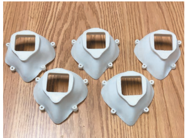
After testing the mold by making these prototypes, the team adjusted the mold, obtained a more flexible thermoplastic rubber, and began production, molding a pair of mask shells every 80 seconds.