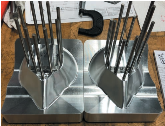
Illinois-based manufacturer, Progressive Components, donated mold components for LATI projects, including the ejector pins for the mold, shown here in a test fitting for the cores.